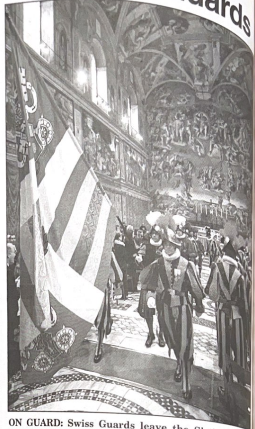
ON GUARD: Swiss Guards leave the Sistine Chapel after a special Mass at the Vatican Jan. 22. The elite Vatican, is celebrating its 500th anniversary. Pope Julius II welcomed the first contingent of Swiss Guards to the Vatican Jan. 22, 1506.

The Vatican and Switzerland also were planning a series of commemorative stamps and coins to mark the 500th anniversary.