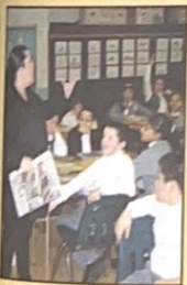
Catholic School Profile of St. Adalbert's, Elmhurst