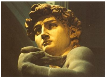
Florence - Statue of David