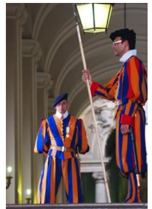
Swiss Guard – The Vatican