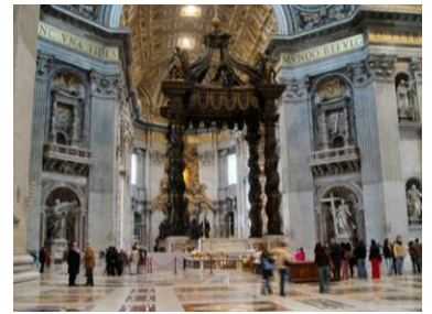
St. Peters Basilica – Main Altar

Sponsored by the Pilgrimage Office of The Diocese of Brooklyn