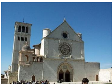
Assisi - Basilica