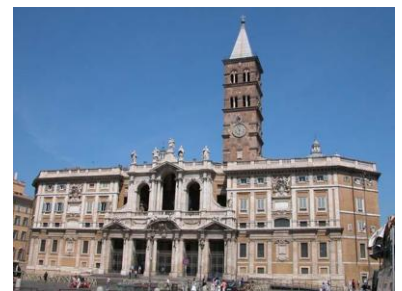
St. Mary Major