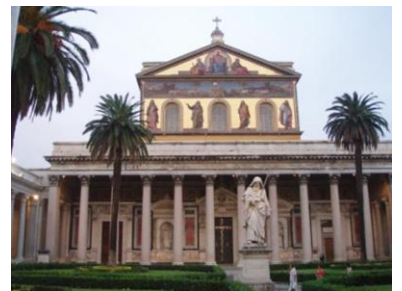
St. Paul Outside the Walls