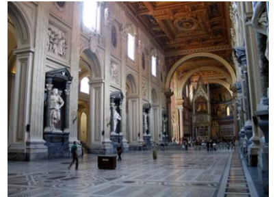
St. John Lateran